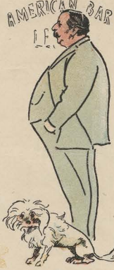
A familiar figure