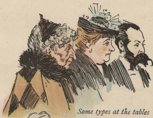
Some types at the tables