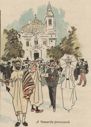
A favourite promenade