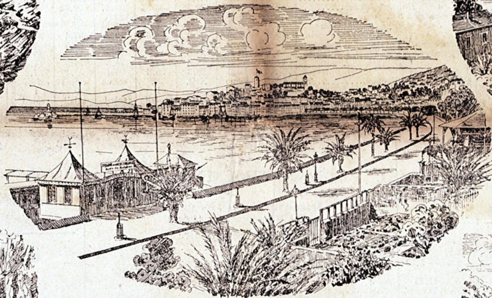
CANNES. — LA CROISSETTE.

ENGLISH TAILOR LUMBERT 47, Rue d'Antibes