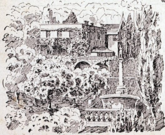
Villa Nevada & Albany Memorial